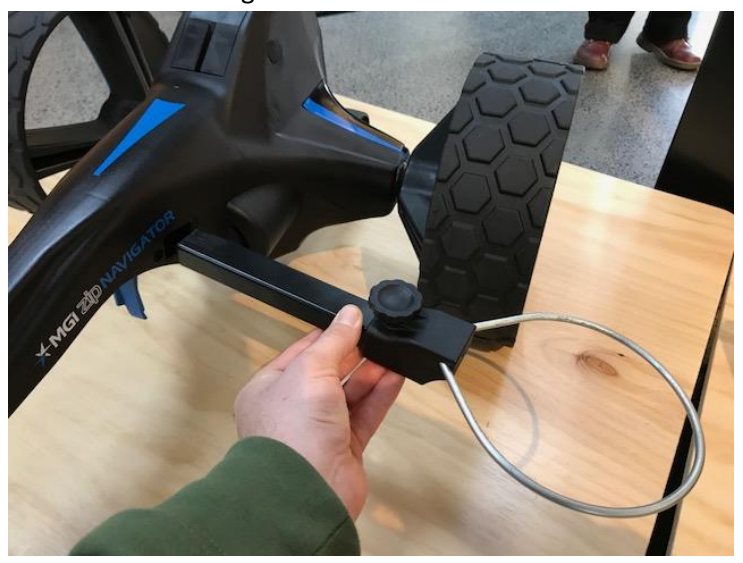
10. Push the lever up until it clicks into position

If you are fitting a sand bucket loop only, connect the loop to the bar supplied and fasten the screw until firm. Release the coloured lever underneath the buggy and insert the bar through the centre of the chassis