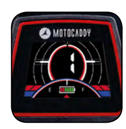
Fig 2 - S1 DHC